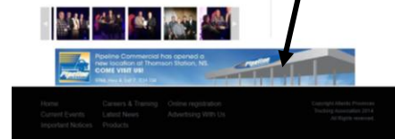
BOTTOM BANNER (728 X 90 pixels)