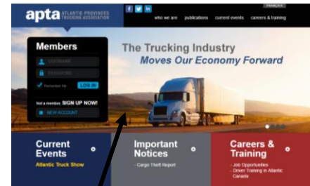
TOP BANNER (960 X 337 pixels)

*Company links are also added with placement ad. By clicking on the ad, members and browsers will automatically connect to your website.