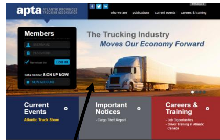
TOP BANNER (960 X 337 pixels)

*Company links are also added with placement ad. By clicking on the ad, members and browsers will automatically connect to your website.