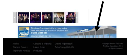
BOTTOM BANNER (728 X 90 pixels)