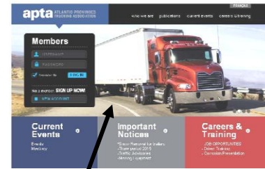
TOP BANNER (960 X 337 pixels)

*Company links are also added with placement ad. By clicking on the ad, members and browsers will automatically connect to your website.